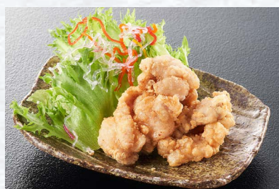
Setouchi Shinrin-Dori Karaage with White Dashi