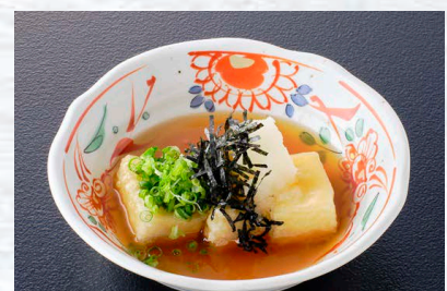
Fried Tofu with Japanese-Style Thick Sauce