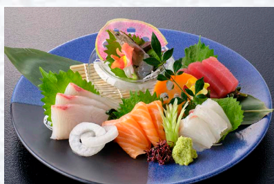
Assorted Sashimi (5 Kinds)